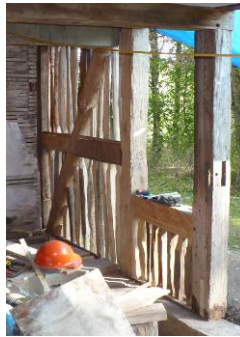
East wall north end staves in place

Problem though when he installed the track for the sliding doors he nailed some big planks onto the side of the building frame. Those planks trapped water behind them, and that moisture in turn caused the timber behind them to severely rot away. So next summer's project is replacing the outer half of that timber. It will be fun because the still solid inner half will stay in place holding up the second floor, as we remove the rotted outer half and install solid ash in it's place. Ric Puls and possibly a structural engineer will be involved to help us fine tune the procedure, hope you can come and help, or at least see it in progress!