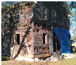
Supports gone! November 2011

thing aligned with tight joints and ready to hold the full weight of the building. Then after putting some stonework under the sill, we removed the jacks and wedges from under it. When the building still stood, we decided we could consider removing two inside screw jack posts that were there at the east end of the room holding up the second floor for almost 15 years... The place looks really different without them!