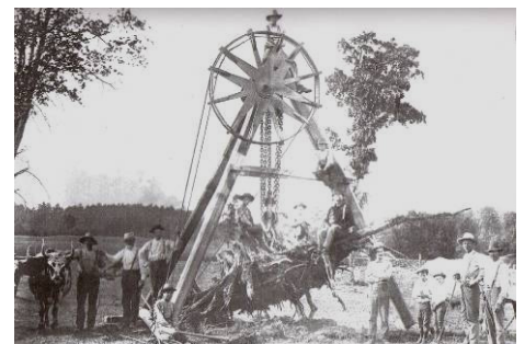
Next edition: Stump pullers, how they shaped and enabled farming

Please make reservations by November 28th calling 920-693-8525 and sending a check to Kathy Sixel at 9716 County Rd X, Newton, WI 53063.